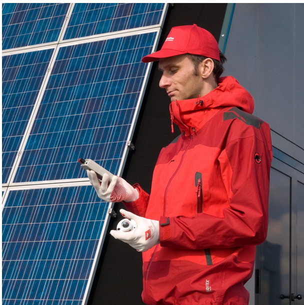
Figure 2 pyranometer in use with LI19 read-out unit