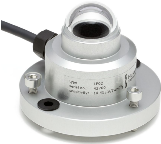
Figure 1 LP02 second class pyranometer

LP02 is a solar radiation sensor that is applied in most common solar radiation observations. It complies with the second class specifications of the ISO 9060 standard and the WMO Guide. LP02 pyranometer is widely used in (agro-)meteorological applications and for PV system performance monitoring.