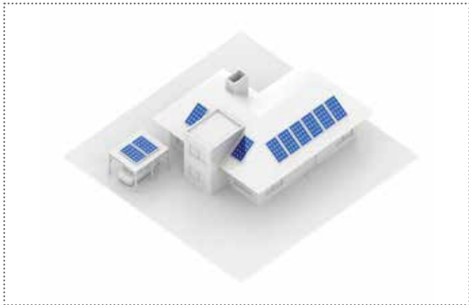
Optimal use of roof surface: Complex roof configurations can be used to maximize system output without impacting the rest of the system.