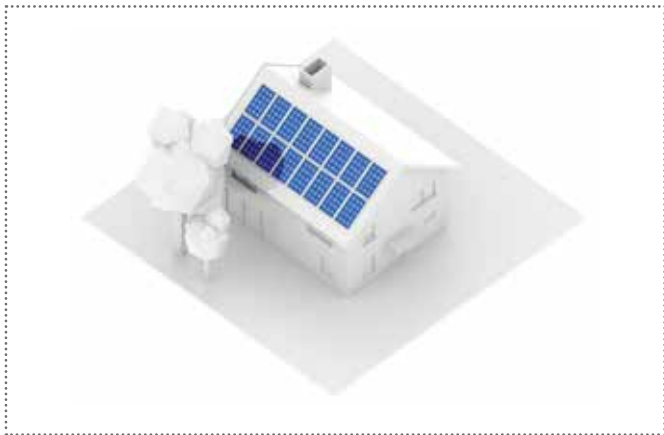
Partial shading: One MPP tracker per module ensures optimal energy production, even with dynamic shading.