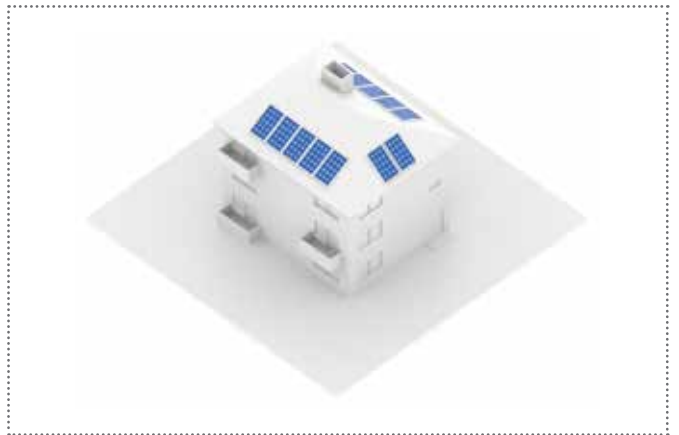
Multiple orientations, no problem: Installers can now use roof space on multiple sides of a home to generate power.